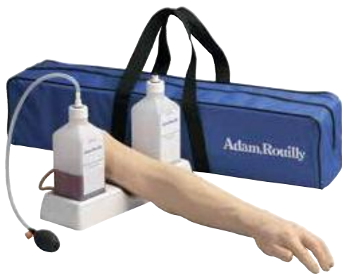
AR251 Infusion Arm, White

The arm features a flexible wrist for added realism, durable silicone skin and is simple to set up, operate and maintain.