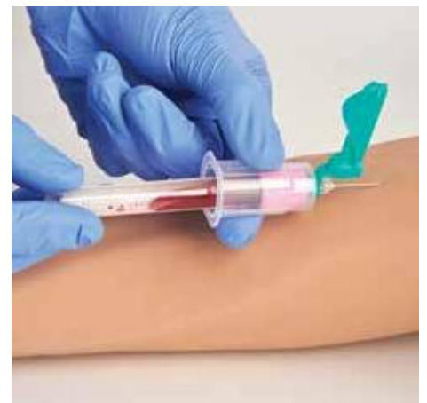
Vacutainer blood withdrawal