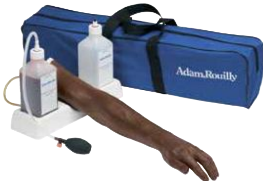
AR251-B Infusion Arm, Black