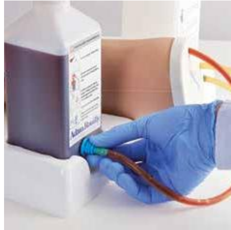
Simple set up