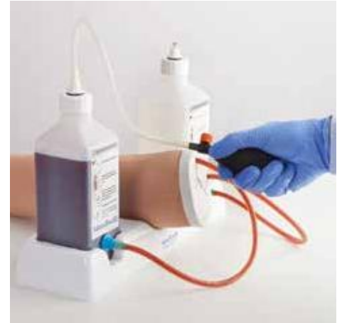
Unique pressurised blood system