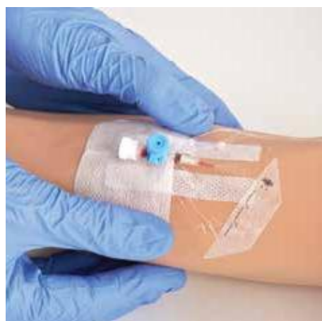
Cannula insertion. Adhesive dressing application